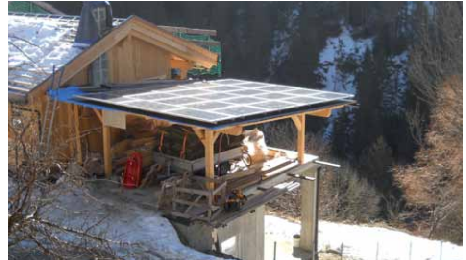
Elpo | St Vigil Enneberg - Italy System: 5,29 kW | Hanger Bolt System