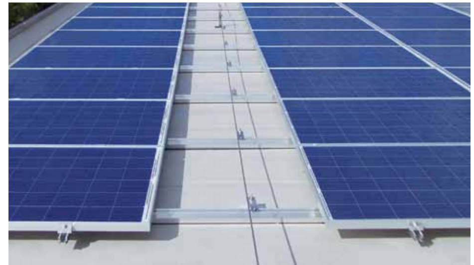
Elpo | Frubona Terlan - Italy System: 671,86 kW | Hanger Bolt System